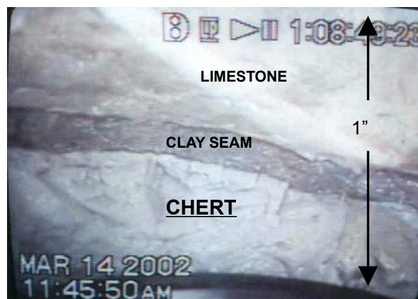
This is a clay seam about 1/8" thick between a layer of limestone and chert. The diagonal light band is a reflection off the TV screen when photographed.